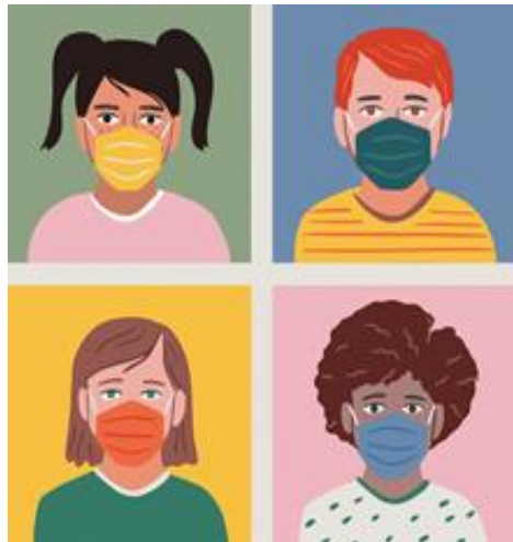
Indoor masking for EVERYONE

Follow the Recommendations of the CDC by: