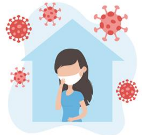
Quarantining for close contacts