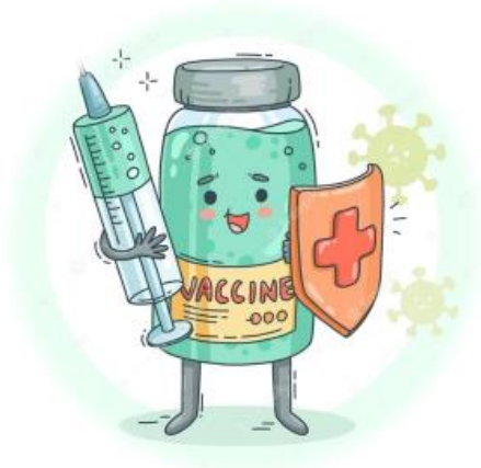
Vaccinations for Eligible Populations