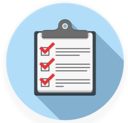
Home Health Survey