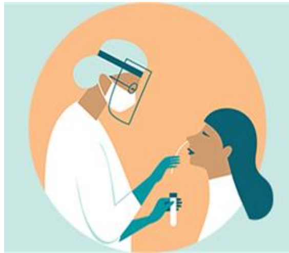
Frequent and ongoing testing for all students and staff